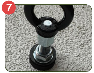
Attach reducer and eyelet.