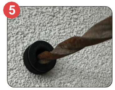
for the throughbolt through the tube, correct depth, tighten nut. and clear debris from hole.