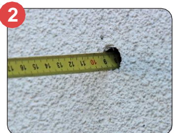
Insert tube, or measure depth of hole from finished render back to the original substrate, adding an allowance of 3-4mm to allow the neoprene washer to compress and provide a seal when installed.